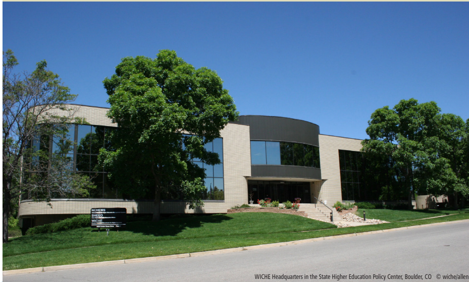
WICHE Headquarters in the State Higher Education Policy Center, Boulder, CO