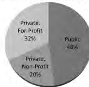
Students Enrolled Exclusively in Distance Ed by Sector

Myth: Distance Education Growth has Slowed.