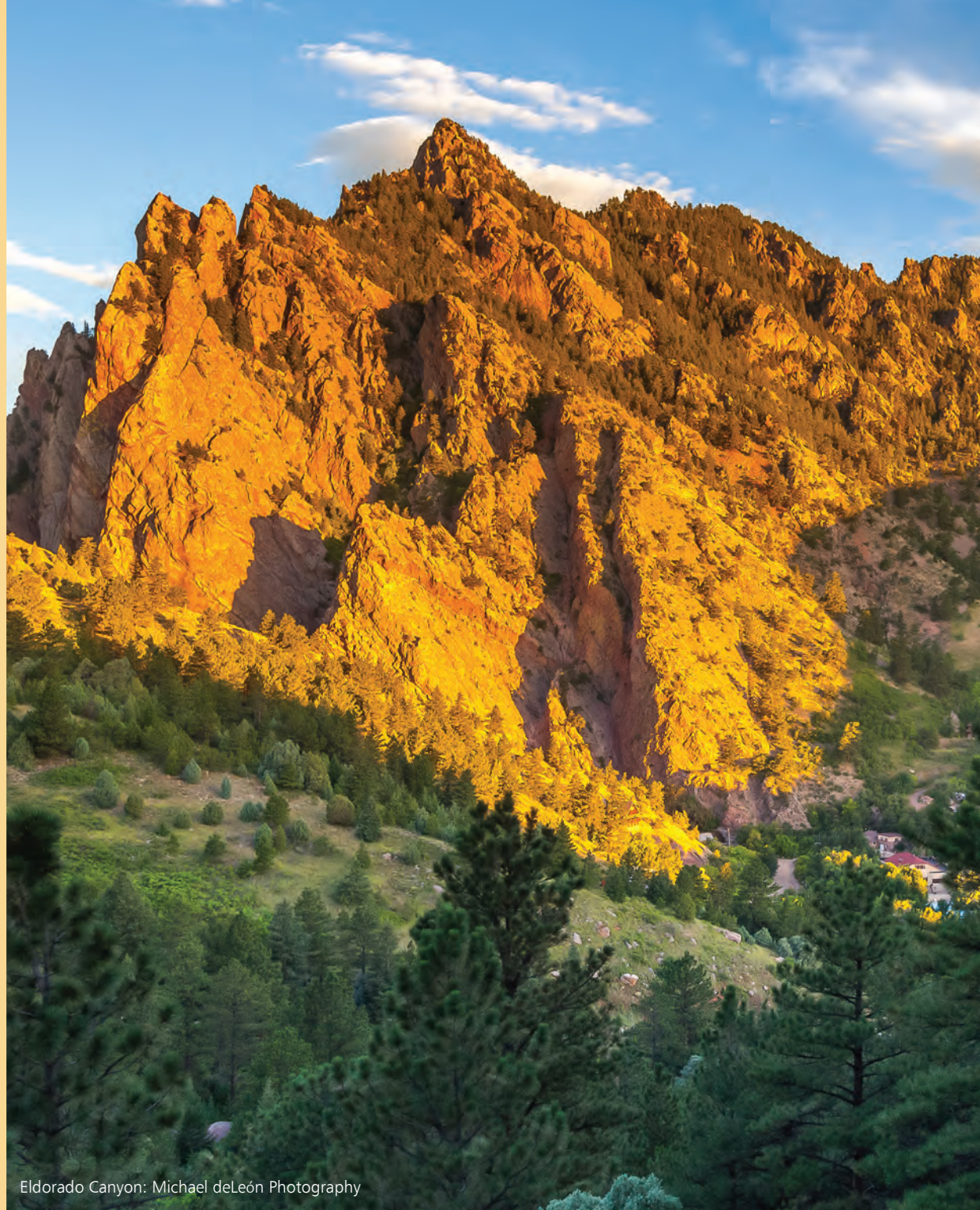
Eldorado Canyon

Western Interstate Commission for Higher Education