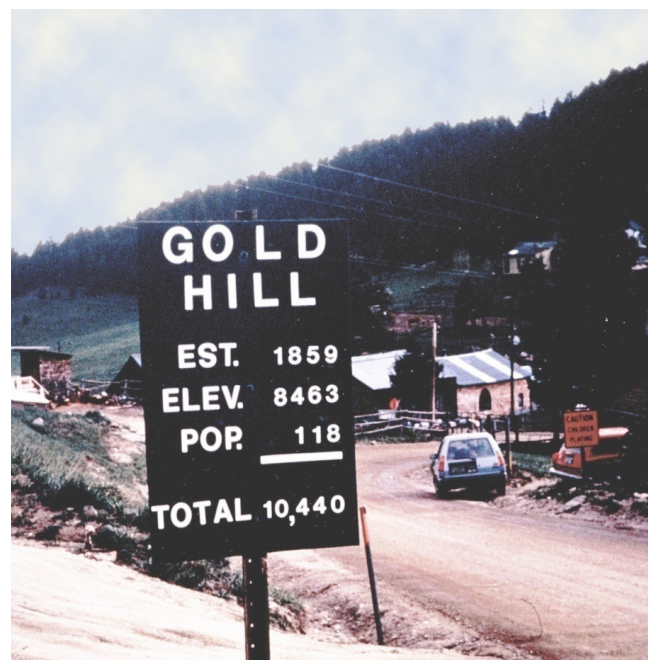
Figure 1. Data Versus Information