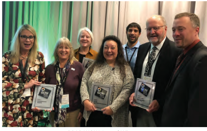
2019 WOW Award Winners