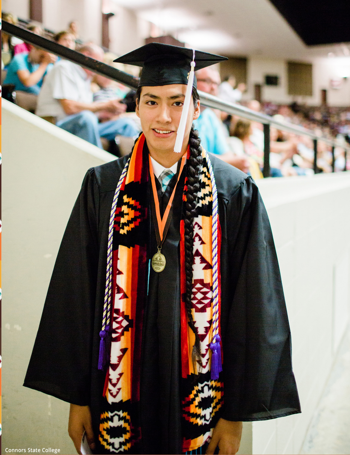
Connors State College