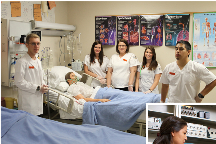
Connors State College