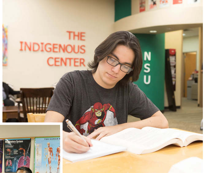
Northeastern State University