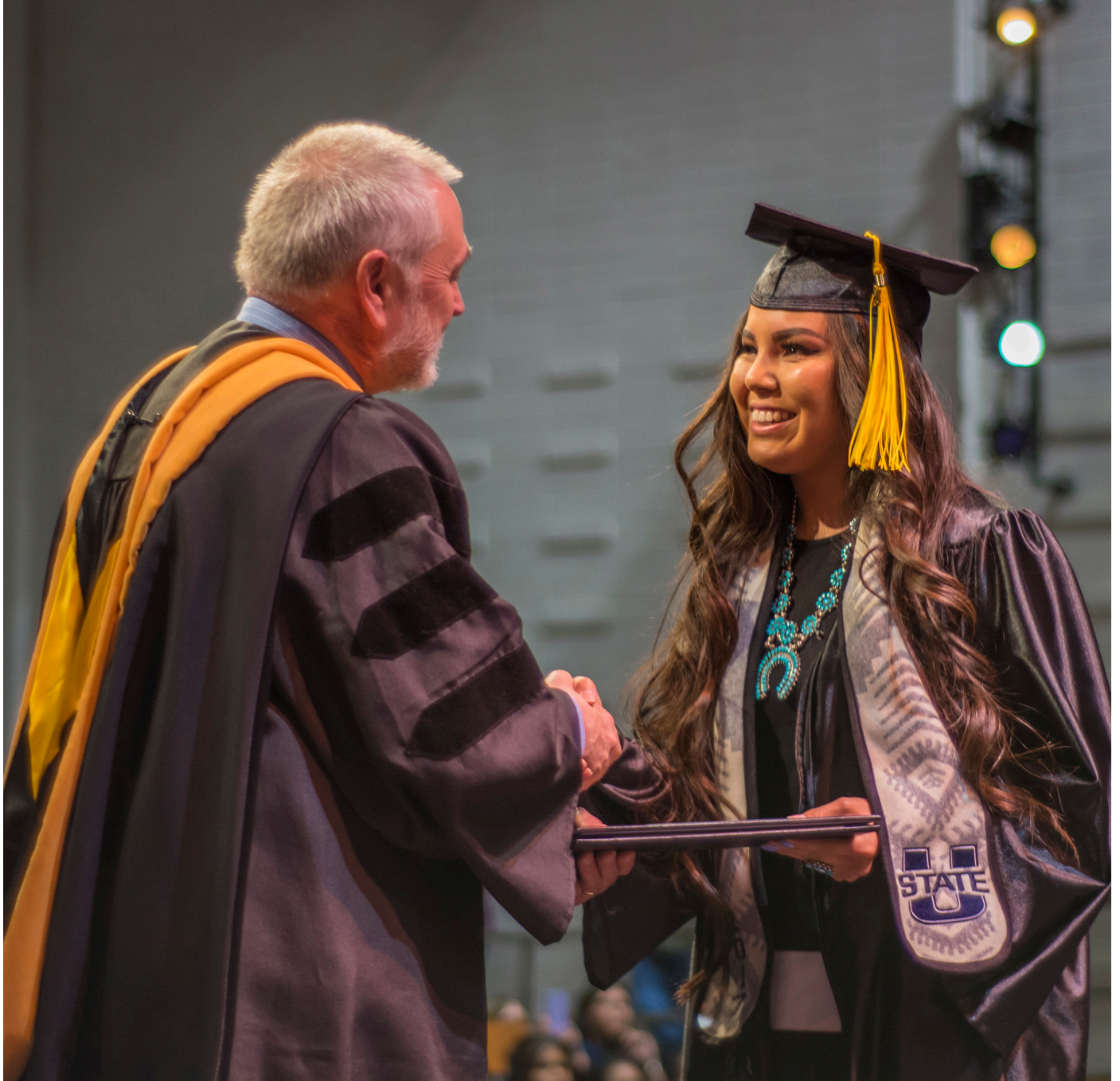
Utah State University