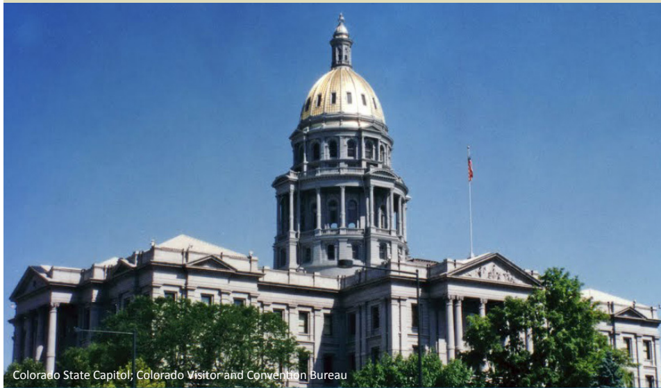
Colorado State Capitol; Colorado Visitor and Convention Bureau