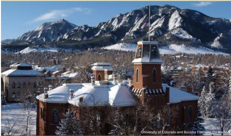
University of Colorado and Boulder Flatirons; CU Boulder

WICHE Western Interstate Commission for Higher Education