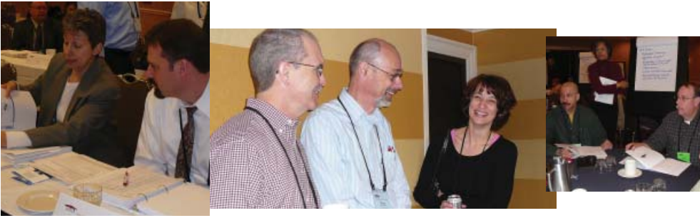
MPP Annual Meeting and Loss Control Workshop March 2009