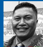
KALANI KANEKO Senator, Majuro Atoll, Republic of the Marshall Islands