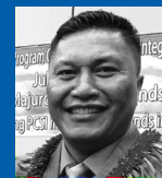
KALANI KANEKO Senator, Majuro Atoll, Republic of the Marshall Islands