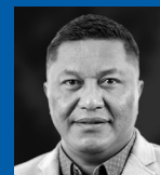
Kalani Kaneko Senator, Republic of the Marshall Islands