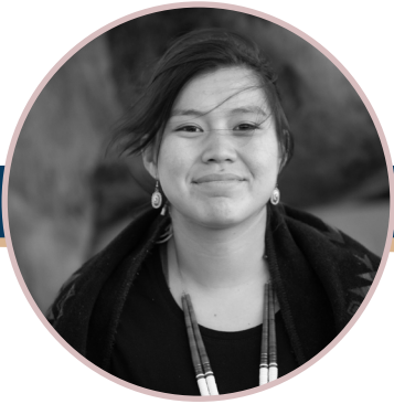
A Comprehensive Communications Strategy to Increase CPL Uptake