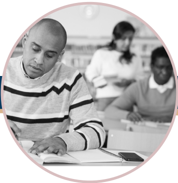
Working With a Community Partner on a CPL Pathway for Immigrant and Refugee Populations

In response, the institution launched a CPL social media campaign and a dedicated CPL web page which clearly outlines how the program works including a video introduction to CPL, description of the potential savings CPL offers, and programs eligible for CPL. Promising early results show that CPL awards have increased among all students, and at a slightly higher rate for students of color (going from 4% of students earning credit to 10%) compared to white students (7% to 12%), slightly narrowing the equity gap.